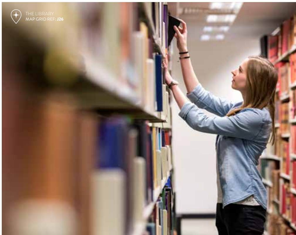
THE LIBRARY MAP GRID REF: J26