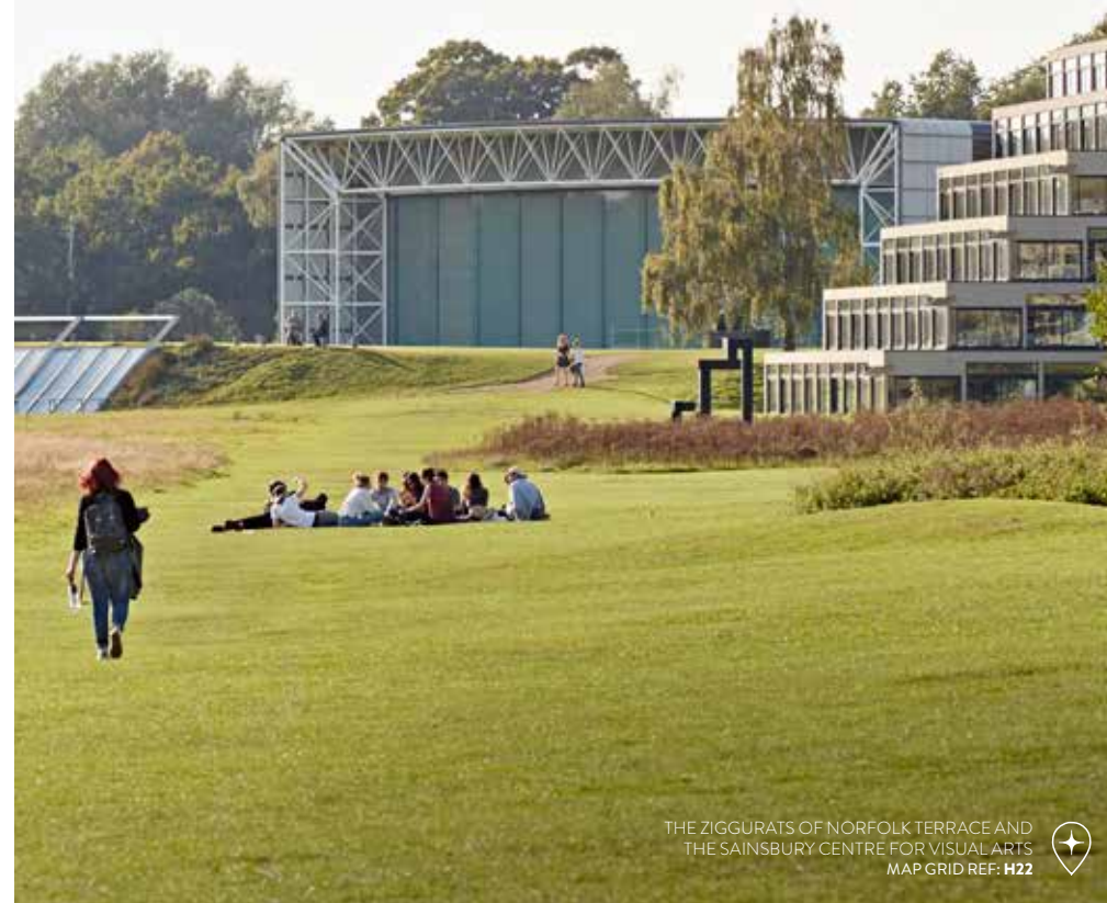
THE ZIGGURATS OF NORFOLK TERRACE AND THE SAINSBURY CENTRE FOR VISUAL ARTS MAP GRID REF: H22